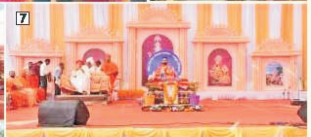
(1) H.H. Shri Acharya Mahara] performing Murti Pratistha in new temple of Porda (Kalinai) and watching cultural programmes. (2) H.H. Shri Acharya Mahara] performing Murti Pratistha in Zundal new temple and Haribhaktas availing the benefit of divine Darshan. (3) H.H. Shri Acharya Mahara] granting blessing in the Sabha on the occasion of Patotsav of Bhaupura temple. (4) H.H. Shri Acharya Mahara] performing Abhishek of Thakorji on the occasion of Patotsav of Anjali temple. (5) Sabha of Saints and Haribhaktas on the occasion of Patotsav of Paldi (Vyasa) temple. (6) Saints of Jetapur performing Abhishek of Thakorji on the occasion of Patotsav of Baraja temple. (7) Mahant Swami of Ahmedabad temple and saint Mandal of Gandhinagar on the occasion of Patotsav of Bhimpura temple and Bhaktotsav. (8) H.H. Shri Acharya Mahara] granting Darshan in the Sabha on the occasion of Katha in Dhanpura Vijapur temple.