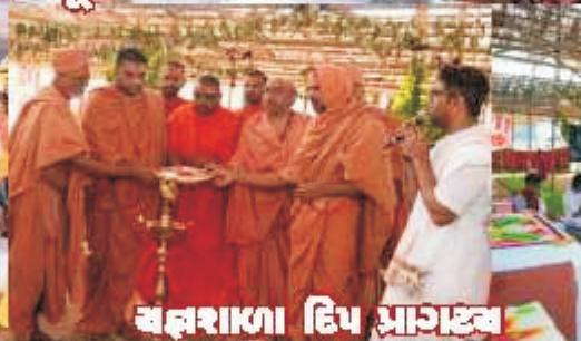
સજ્ઞાસાળા દિપ પ્રાગટ્ય