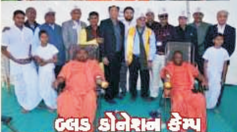
GLS डोनेशन केम्प