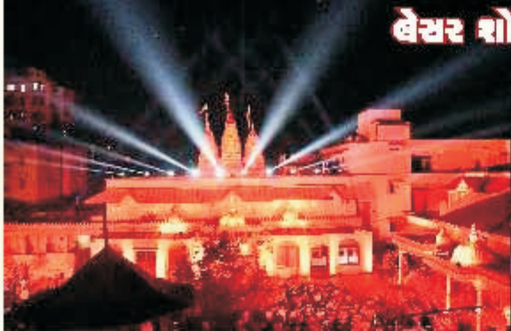
वेसर शो - सोशनी