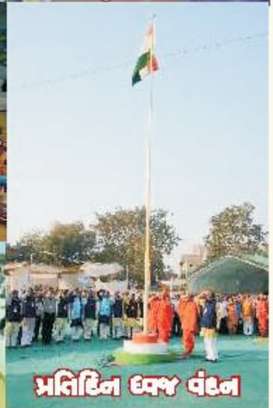
પ્રતિદિન ધ્વજ વંદન