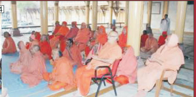
(1) Shiksha Patri Poojan in our Atlanta (U.S.A.) temple on the occasion of Shiksha Patri Jayanti. (2) Shakotsav in our Shree Swaminarayan temple, Baltimore (U.S.A.). (3) Shakotsav in our Shree Swaminarayan temple, Sine Mansion and Fund raising and Candle March for Martyr Jawans of India. (4) Sants and Haribhaktas performing Dhoon for peace of souls of Jawans martyred in Pulwama terrorist attack.